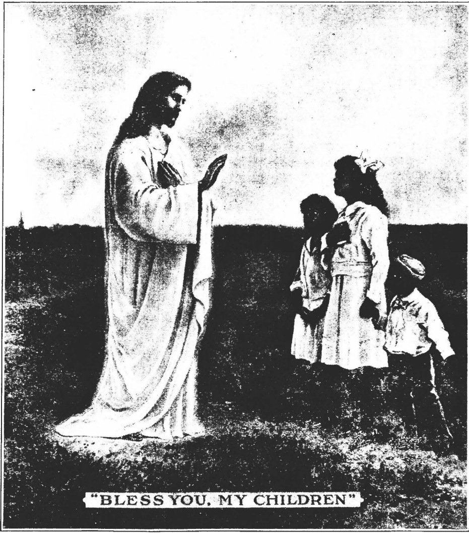
"BLESS YOU, MY CHILDREN"